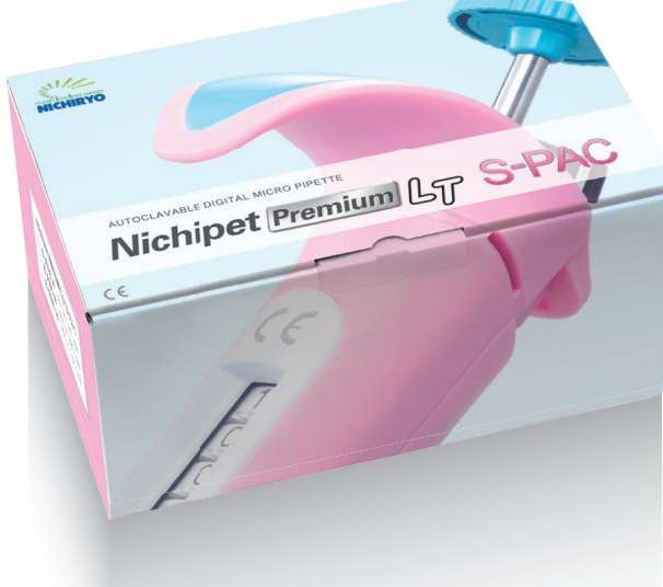
Nichiryo Tube Opener (code:00-NTO)