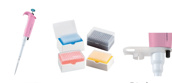
Nichipet Premium L 3 pcs